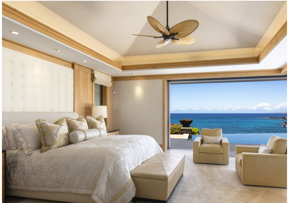
OCEANFRONT ESTATE | 6 BEDROOMS | 7.5 BATHROOMS | LIVING AREA 7,447 SQFT | LAND 42,210 SQFT